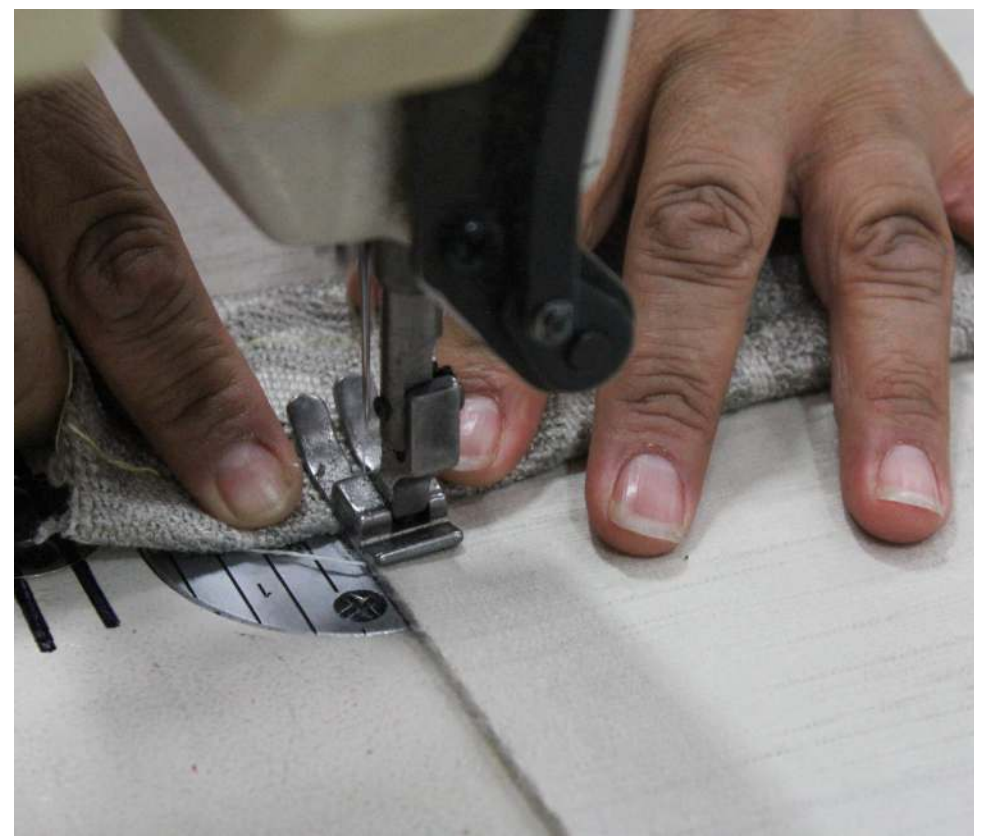
Tonight you will be sleeping on a hand-made mattress designed and built by a group of people who believe our job is to create a mattress that provides a foundation for a healthy life.